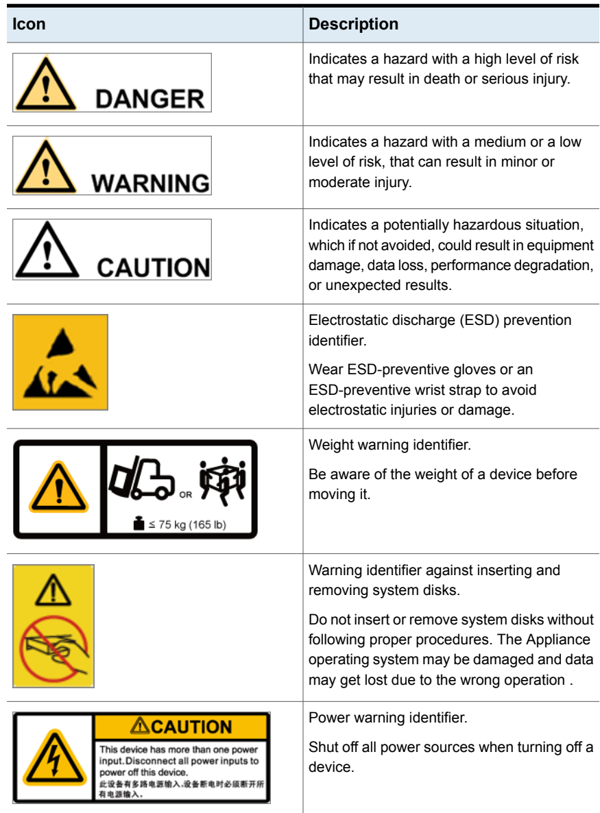
Table 1-1 Warning icons

Warning icons remind you of safety precautions to be followed during installation and maintenance operations.